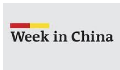
OnePlus, China's All-Conquering Mobile Brand