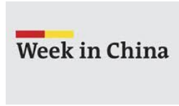
SOE's Role in China Economy