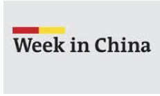
China's Biggest US Takeover