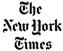
Private Equity in China, Where To?