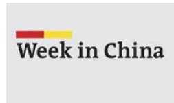
SOE's Role in China Economy